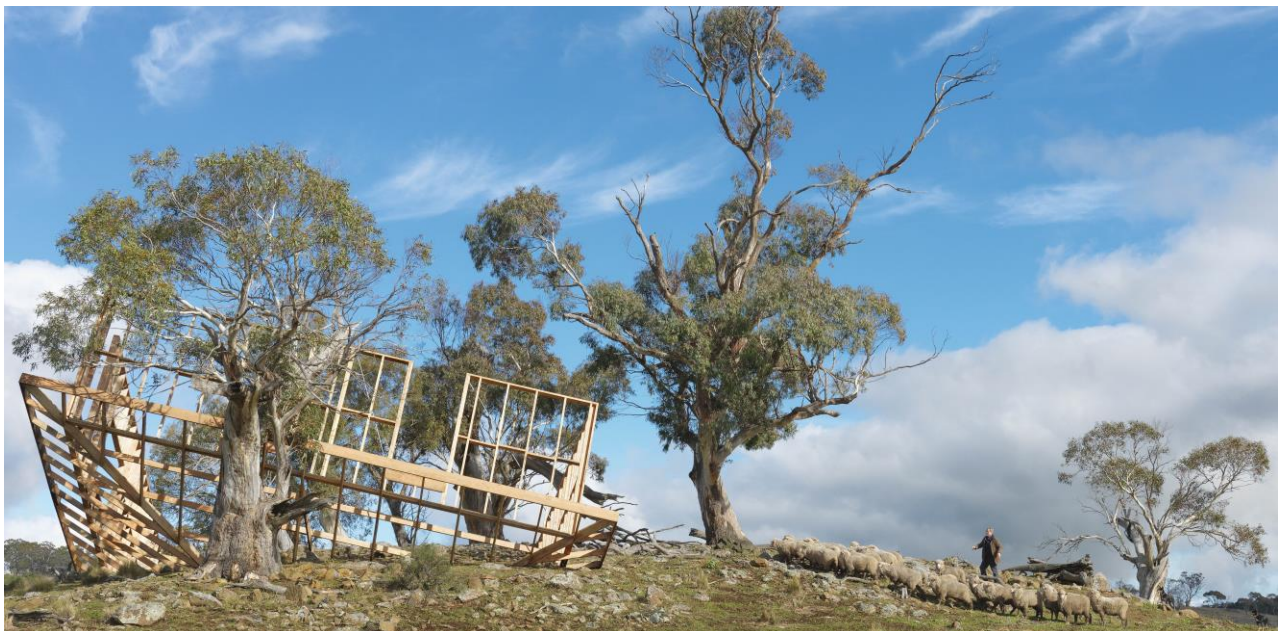
Rosemary Laing, Aristide 2010, from the series leak , C Type photograph, 110 x 223 cm The University of Queensland Art Museum, Brisbane Collection of The University of Queensland, purchased 2011 © Rosemary Laing, Courtesy Tolarno Galleries, Melbourne

Exhibition Admission: $12.00 Adults; $10.00 Seniors; $8.00 Pensioners and Students; Children 12 and under free.