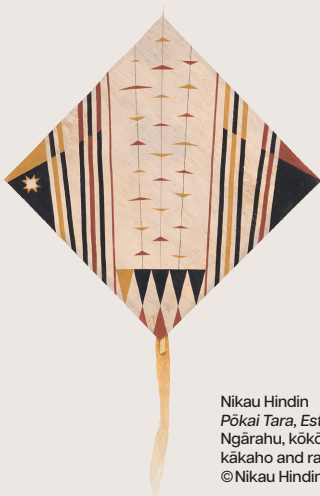
Nikau Hindin Pōkai Tara, Esteemed Gathering 2023 Ngārahu, kōkōwai and kerewhenua on aute, kākaho and rattan frame with painted aute tail © Nikau Hindin, courtesy of the artist and N.Smith Gallery, Sydney

Once you've finished, ask a parent or guardian if they can take a photo of your creative response and send it to museum@twma.com.au or tag us online #TarraWarraArt